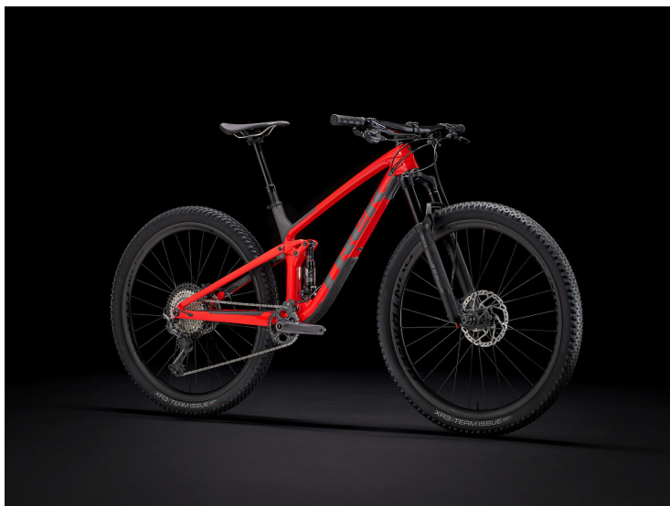
Trek Bicycle Company